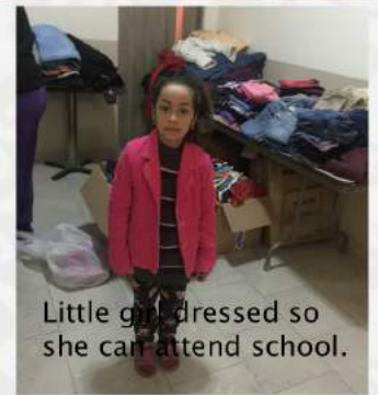
Little girl dressed so she can attend school.